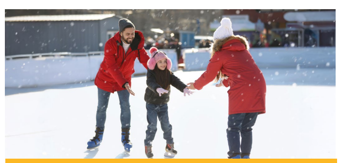
Coming Soon: New Outdoor Rink at Monkton Circle Park (2025/2026)