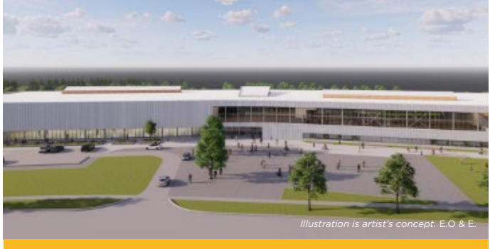
Embleton Community Centre

Significant investments are being made to create modern, inclusive community spaces that inspire recreation and foster pride. We are also increasing recreational programming by five per cent, ensuring a broader range of activities to meet the diverse needs of the community.