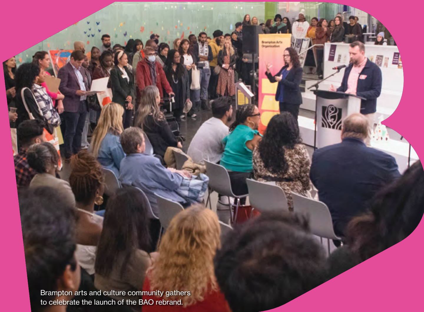
Brampton arts and culture community gathers to celebrate the launch of the BAO rebrand.