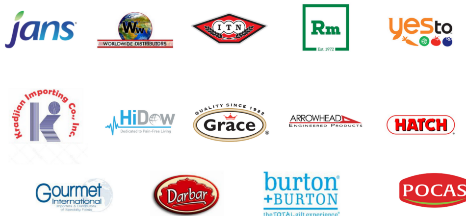
Some of Order Taker's customers